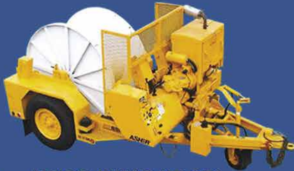
HOGG-DAVIS HP-650 Cable Pulling Trailer