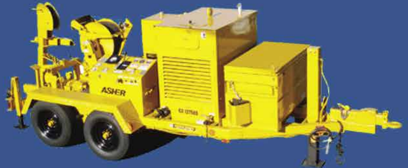
Sherman Reilly UnderDawg Bull Wheel Puller