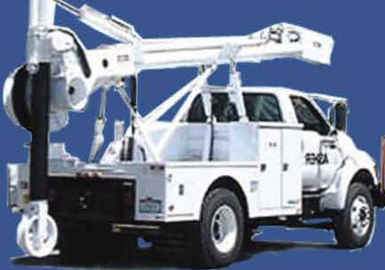
FORD Diesel Champion Cable Scraper Hi-Speed Cable Removal