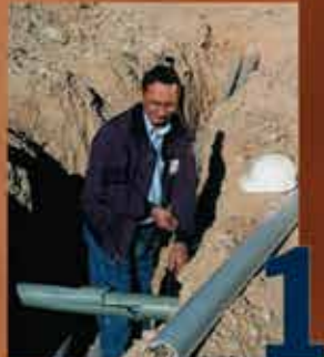
1 Step 1: Remove Damaged Conduit