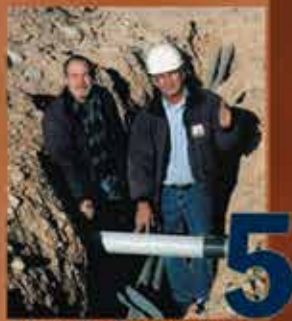
5 Step 5: Finish Job in Record Time

Please Visit Our Website at WWW.CONDUITREPAIR.COM