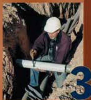
3 Step 3: Snap in Place