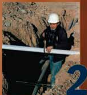
2 Step 2: Cut Split Duct Conduit to Fit