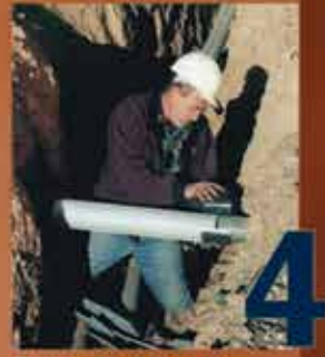
4 Step 4: Attach Adapters