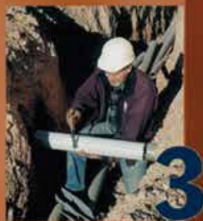
Step 3: Snap in Place