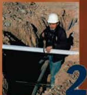
Step 2: Cut Split Duct Conduit to Fit