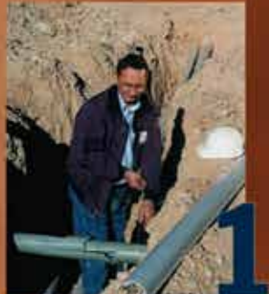
Step 1: Remove Damaged Conduit