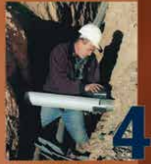
Step 4: Attach Adapters