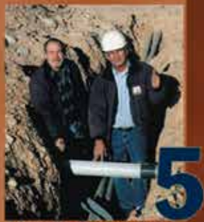
Step 5: Finish Job in Record Time

Please Visit Our Website at WWW.CONDUITREPAIR.COM